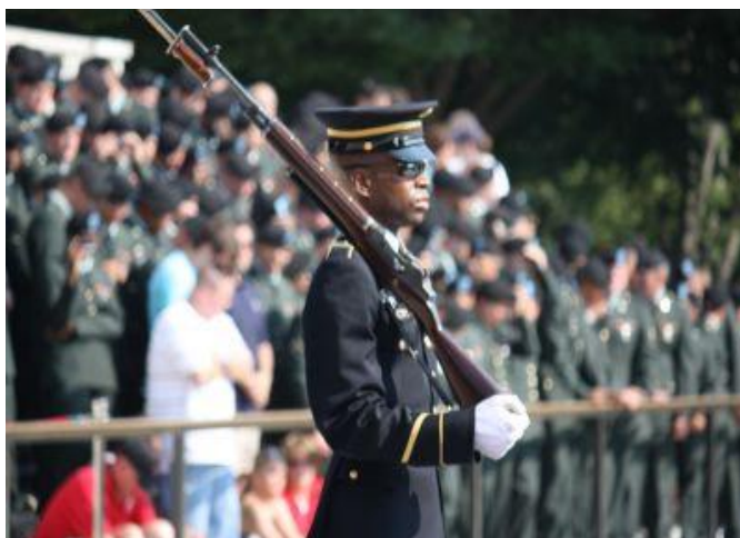
Soldiers and visitors observe the changing of the guard at the Tomb of the Unknowns watch during Memorial Day, Monday, May 31, 2010, at Arlington National Cemetery.