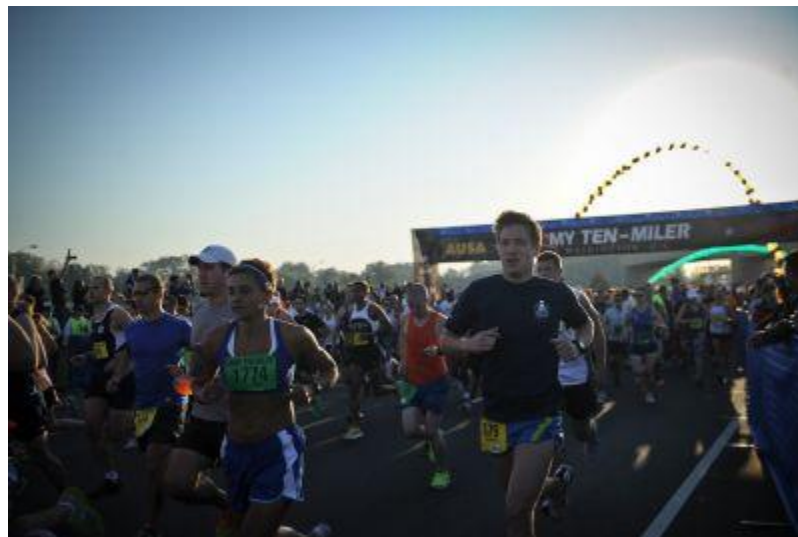
More than 30,000 runners participate in the 2011 Army Ten Miler in Washington, D.C. Sunday October 9, 2011.