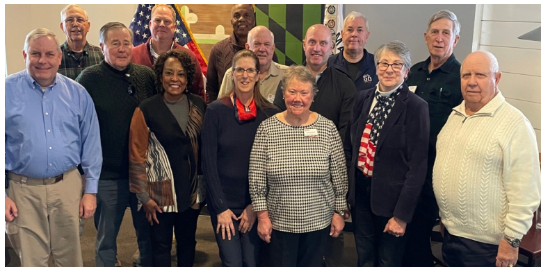
Your 2025-2026 Maryland Council